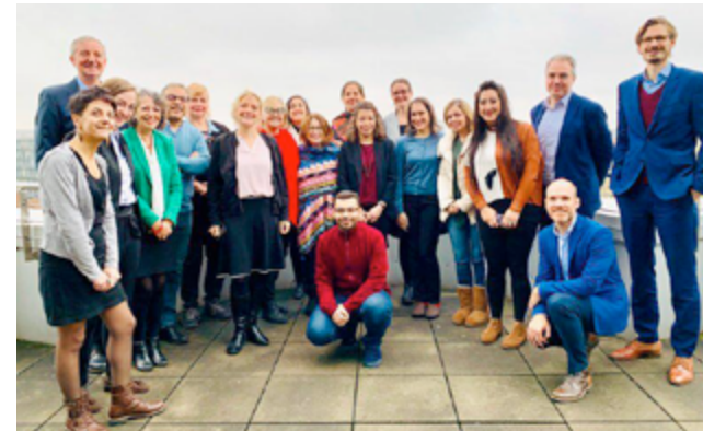
ALF-members meeting German private and political foundations, invited by the working group MENA

The international guests of the visiting tour and German network members of the Anna Lindh Foundation came together to focus on the question how the network can unfold its potential through each of its members. The session combined theoretical and practical interactive elements on network analysis, roles of members within different types of network and a demonstration on Virtual Community Hosting.