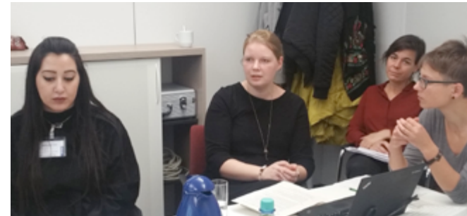
Inspiring insights to the work of Kreisau Initiative Berlin e.V.