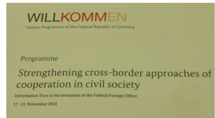
ALF-members from France, Israel, Jordan, Palestine and Poland joined the Information Tour to Berlin