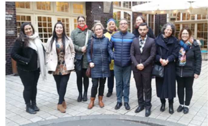
Visit to Hackesche Höfe in Berlin

The second leading topic concentrated on the „ Digital Civil Society “: How to use the potential of digitisation for overcoming social disadvantages, for more civic engagement and for social cohesion? Talking about digitisation, it is important to not only focus on the technologies but especially on their effects on society. Showcasing examples for digital actors of civil society and discussing opportunities and risks of digitisation for CSOs in international cooperation, were the main focus in this topic.