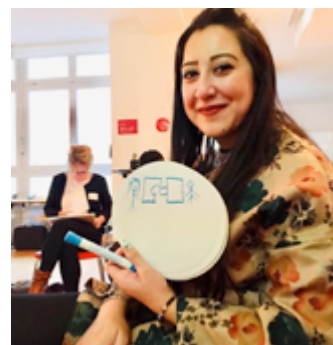
Visualising diverse types of collaboration during the iac-workshop