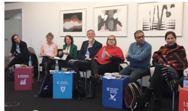
Meeting in the BMW Foundation at the invitation of the working group MENA

“Exchange of experience on cross-border civil society cooperation” was the main topic of the meeting and discussion with representatives of the working group “Middle East North Africa (MENA)” , hosted by the BMW Foundation.