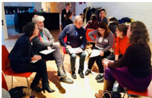
International ALF-guests and German ALF-members discussing means to create more impact in iac Berlin