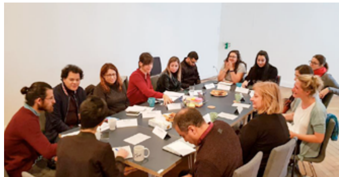
Listening, learning, discussing and planning future projects

Discussions after the presentation of IMPACT's team revolved around the role and space available for Syrian civil society and the challenges facing Syrian CSOs in Syria and abroad.