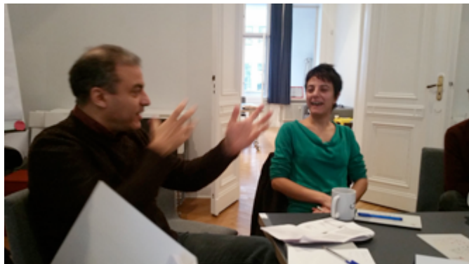
Vivid discussions during the visit at IMPACT e.V.

The visit at Kreisau Initiative Berlin e.V. showed that cross-border cooperation is not a new phenomenon. The ALF-member-organisation has been working in close collaboration with its partner „Kryzowa Foundation For Mutual Understanding in Europe” for the last 30 years. Moral courage, social and political engagement, commitment to democracy and human rights are the main focus of their work.